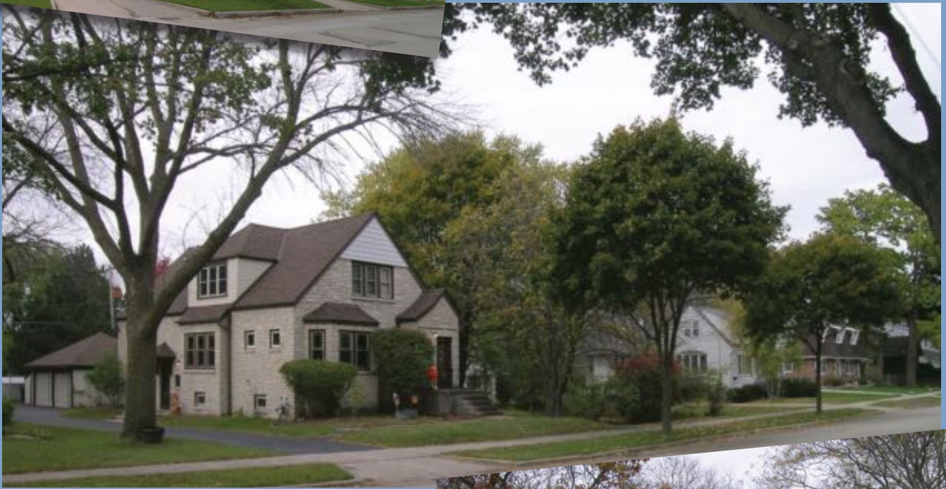
Today's neighborhood-Houses on S. 96th St.