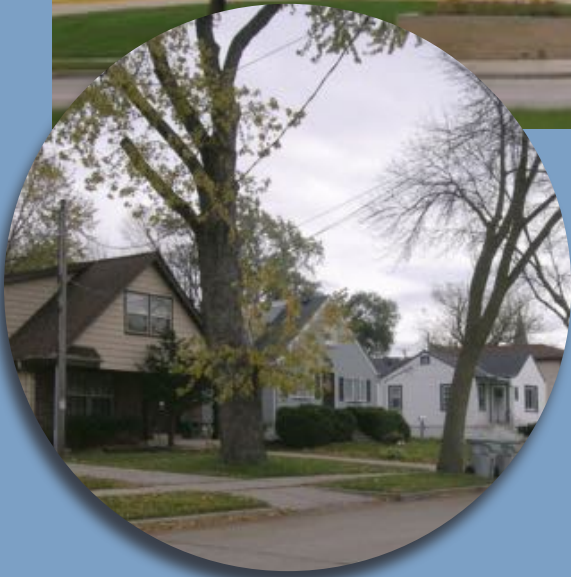
Today's neighborhood-Houses on S. 95th St. & W. Oklahoma Ave.