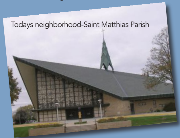
Today's neighborhood--Saint Matthias Parish

A major housing boom after the war pressed many families of returning servicemen and others further west. At the same time, the City of Milwaukee was engaged in a massive annexation program in the area. Between 1948 and 1953, a series of annexations added territory between Lincoln Avenue and Cold Spring Road and South 40th Street and South 100th Street. The area became eligible to receive city services such as road building and road improvement, which in turn attracted more residents. By the late 1950s, the West View neighborhood has just over 100 residences (some so new they were still vacant). Many roads were under construction. The neighborhood was becoming a polyglot of ethnic families. Besides Poles and Germans, there were residents with ancestry from Ireland, Ukraine, Sweden, England, Cuba, Italy, and Austria.