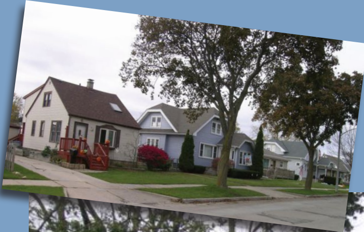
Today's neighborhood-Houses on S. 97th St.