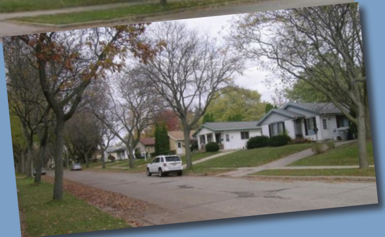
Today's neighborhood-Houses on S. 93rd St. & W. Morgan Ave.