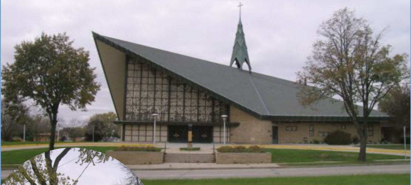
Today's neighborhood-Saint Matthias Parish